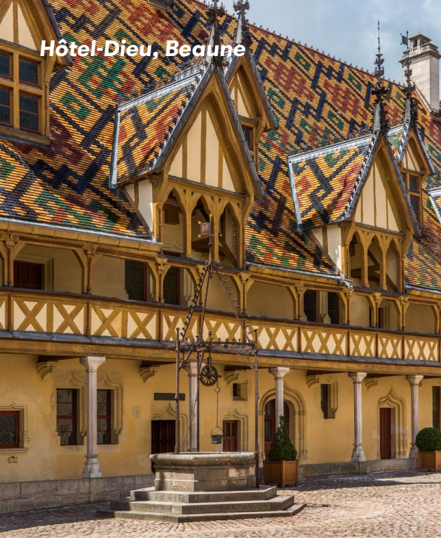
Hôtel Dieu, Beaune

life of the Virgin. In the afternoon we travel to Autun, to admire the fine Romanesque sculpture of its St-Lazare Cathedral, among the world's best. We then visit the Roman Gate of Porte Saint-André and the Roman amphitheatre before returning to Dijon. Evening at leisure. Overnight Dijon (B)