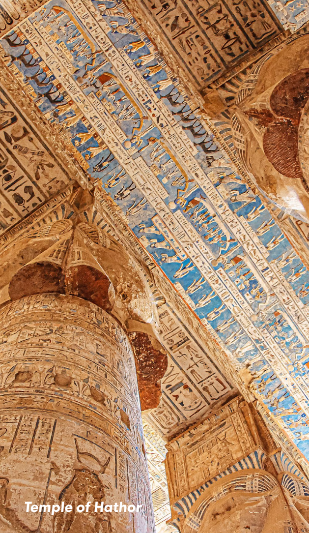
Temple of Hathor