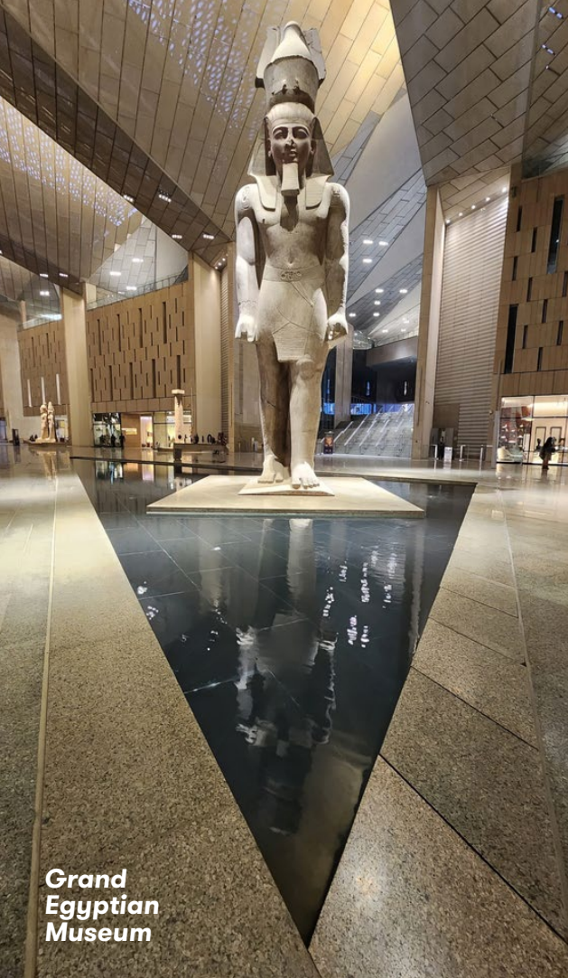
Grand Egyptian Museum