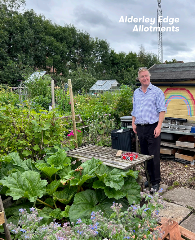
Alderley Edge Allotments

like it in Britain. Created by James Bateman (1811-1897), it sits in the interim period between the landscapes of Capability Brown and the High Victorian style. The garden is separated into many 'rooms' representing areas of the world, each completely distinct from the other. They include an Egyptian garden where two sphinxes guard the mastaba-like entrance to the tomb-like grotto and a Chinese garden with pagoda and bridge. After a break for lunch on the extraordinary grounds, we contrast our visit with the backache and bounty of British allotment gardening, arriving at Alderley Edge Allotments in the early afternoon. The English allotment is an extraordinary phenomenon dating back to the development of 'common land' in Saxon times. Enshrined in law to protect them, the now often highly-desirable development property is instead owned and gardened by Allotment Associations all over the country. After exploring the various allotment sites, we stop for a well-timed English afternoon tea as guests of brother and sister, Graham and Stella Heap. We arrive back at our hotel in the early evening. Overnight Chester (B, AT)