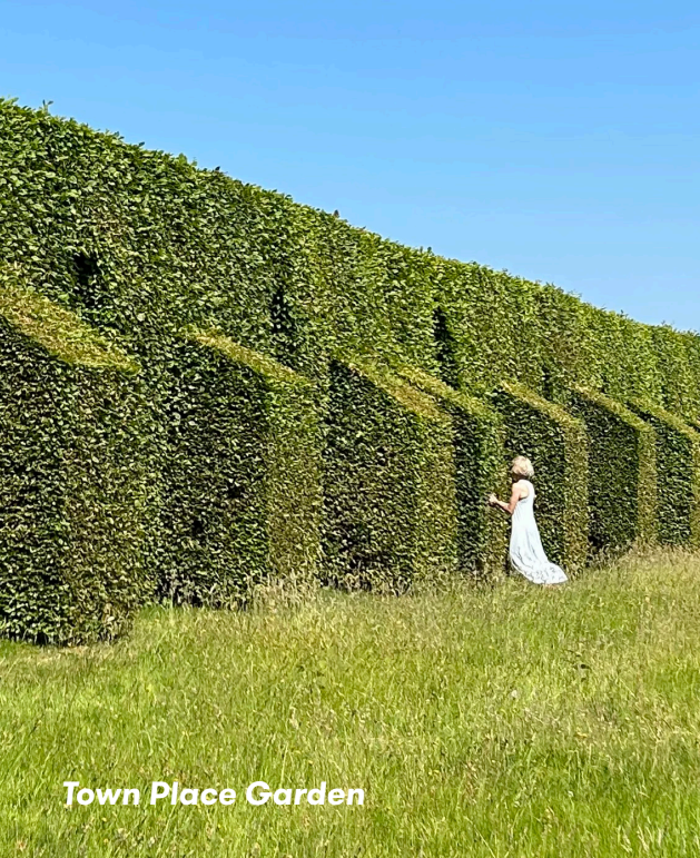
Town Place Garden