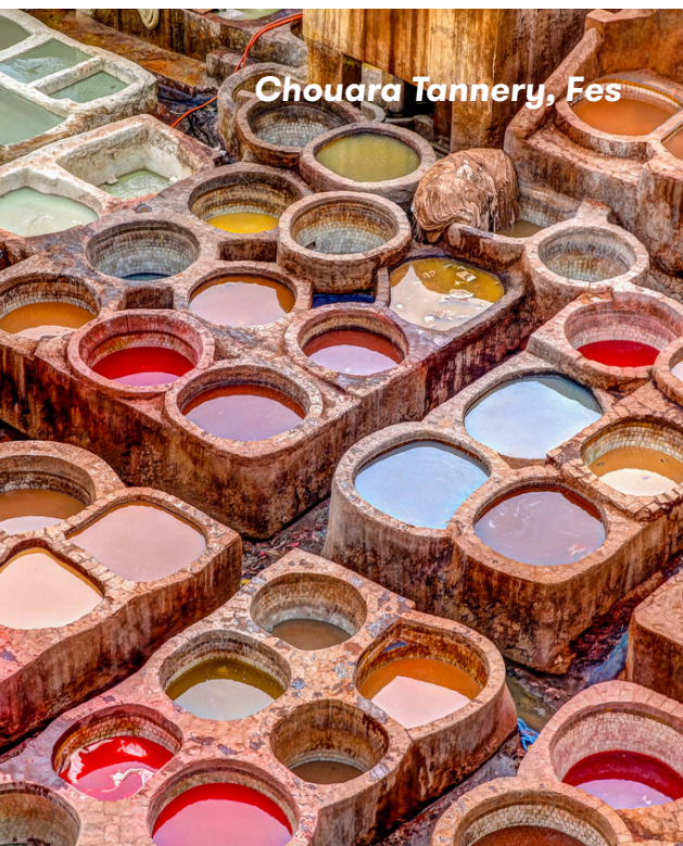
Chouara Tannery, Fes

Today we travel through the Rif to Chefchaouen, a picturesque walled town known for its blue-washed buildings with red-tiled roofs adorned with pots of flowers. We'll tour the compact medina and kasbah before we have lunch and check into our centrally located riad. The afternoon is free for relaxation and further exploration. Overnight Chefchaouen (B, L)