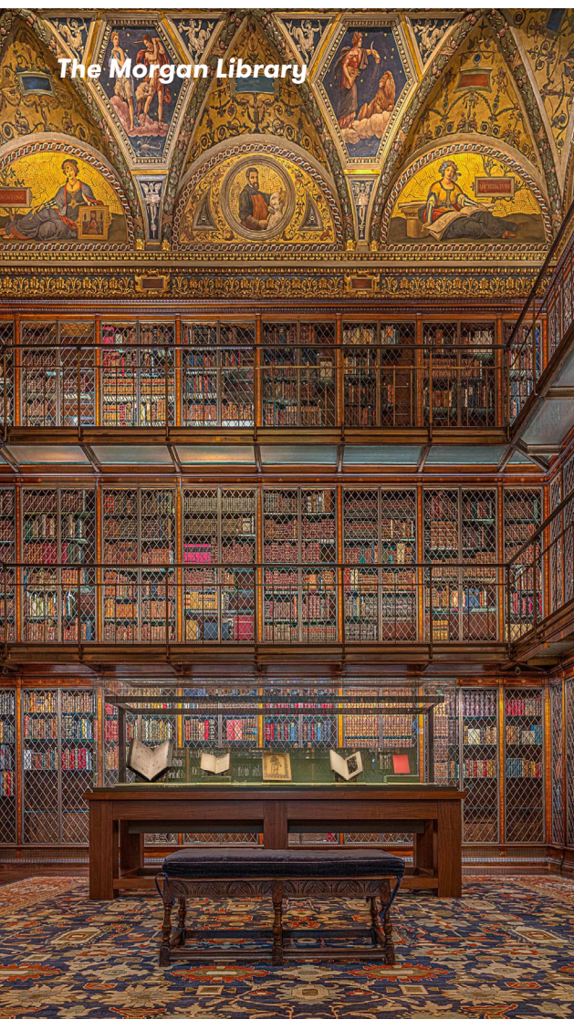
The Morgan Library