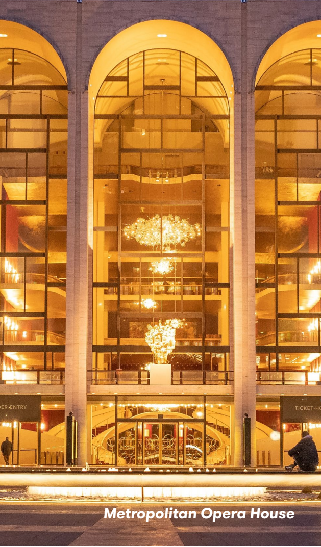
Metropolitan Opera House