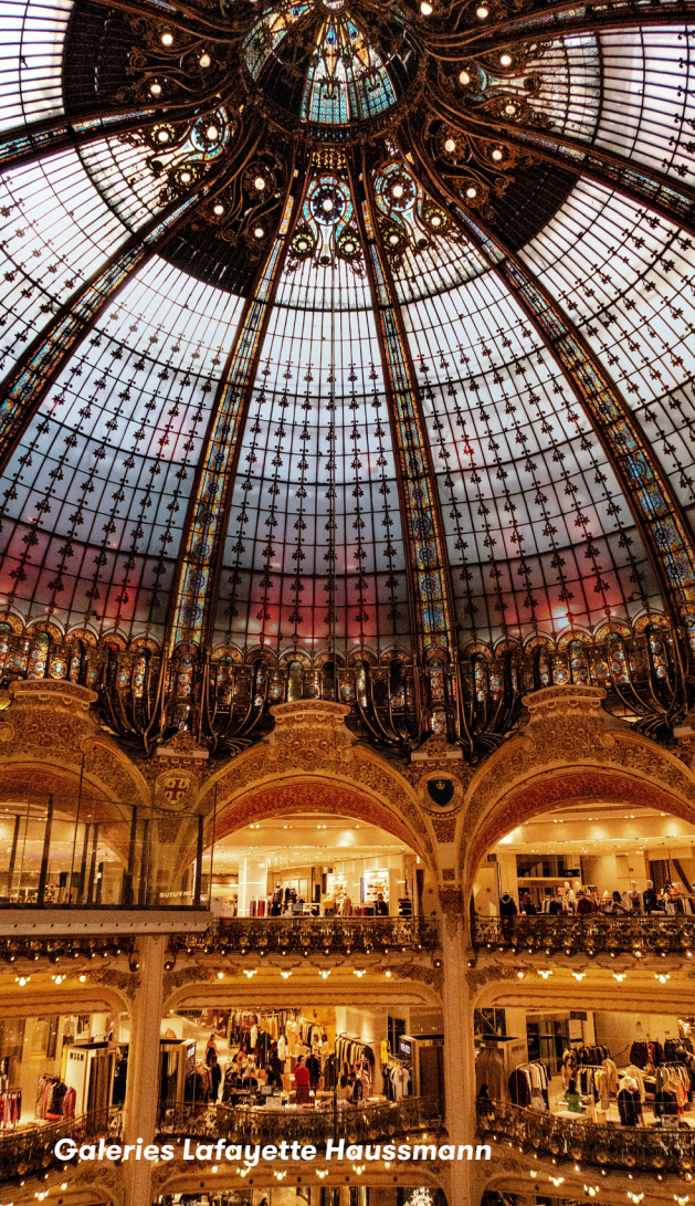
Galeries Lafayette Haussmann