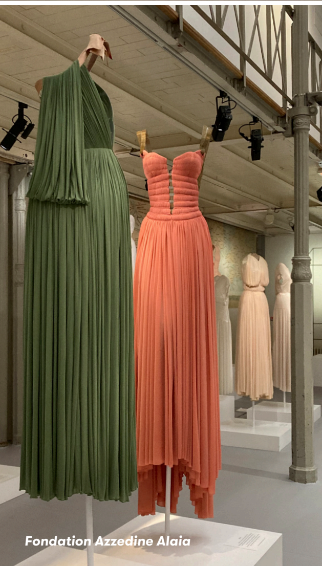
Fondation Azzedine Alaïa

Fragonard, founded in 1926. Here we have the opportunity to create our own bespoke scent before our guided tour of the museum reveals the fascinating history of perfume. Returning to the hotel the evening is at leisure. Overnight Paris (B, L)