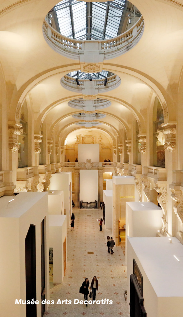
Musée des Arts Décoratifs