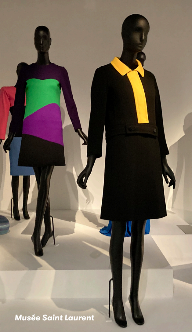
Musée Saint Laurent