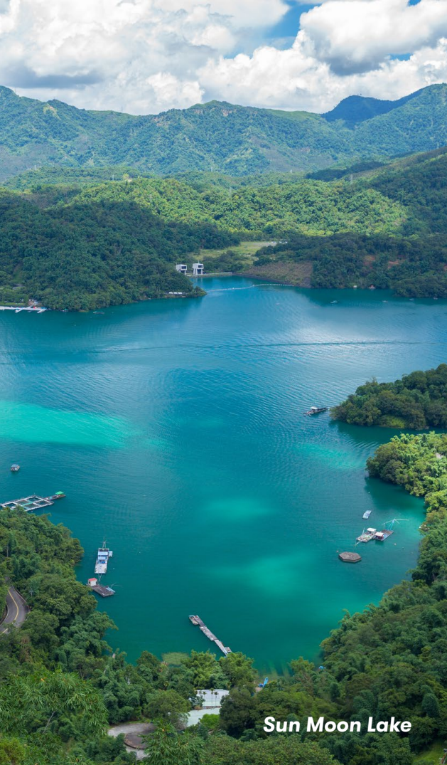
Sun Moon Lake