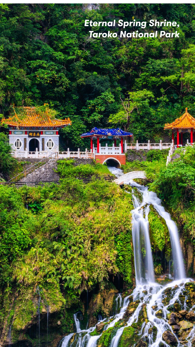
Eternal Spring Shrine, Taroko National Park

sculpture garden. The collection also includes documents for the Ming and Qing Dynasties and works from the Japanese era through to the period following the Second World War, effectively documenting Taiwan's history through its art. We continue to Sun Moon Lake, our base for the next three nights, and enjoy dinner in one of our hotel's excellent restaurants. Overnight Sun Moon Lake (B, L, D)