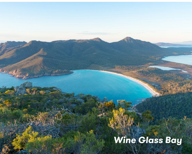
Wine Glass Bay