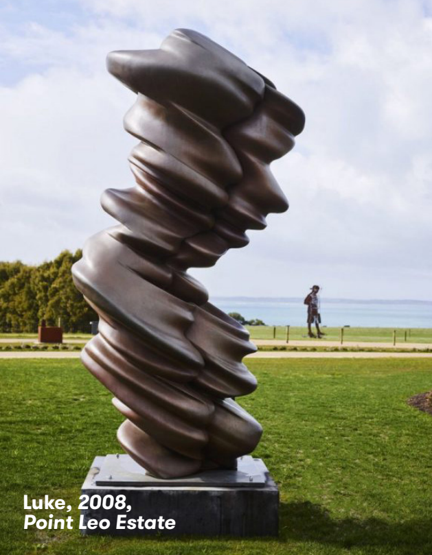
Luke, 2008, Point Leo Estate