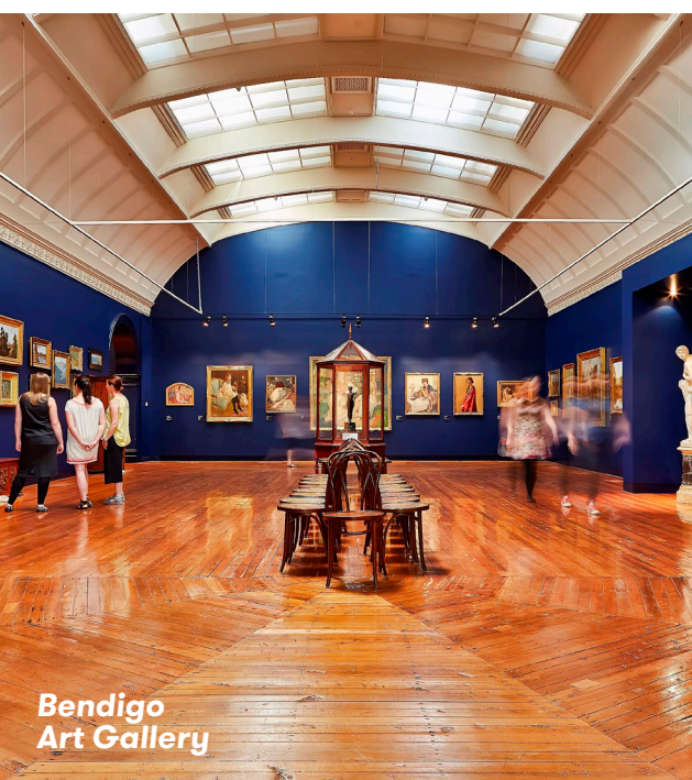
Bendigo Art Gallery

township in the 1850s, when 20,000 miners arrived to exploit the newly discovered goldfields, and the town shot to further prominence in 1854 when a rebellion of gold miners went against the strict licensing and heavy taxation of the British colonial authority. Ballarat's place in the birth of the national story was further enhanced in the 1880s when the citizens of the town established Australia's first regional gallery as a way of providing access to art for the people and advancing the city's status. We visit the excellent collection at the Art Gallery of Ballarat, which has works by almost every major Australian artist from the 1870s to the end of the 20th century. After a break for lunch, we enjoy a leisurely stroll around Ballarat's Lake Wendouree before exploring the nearby Botanical Gardens. We continue on to Bendigo, our base for the next three nights, stopping to visit the small Gold Rush town of Maldon that has preserved much of its original architecture and feel. Arriving in the late afternoon, we enjoy dinner at a local favourite, Ms Battershams. Overnight Bendigo (B, D)