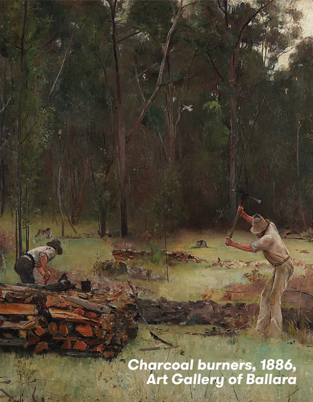
Charcoal burners, 1886, Art Gallery of Ballara