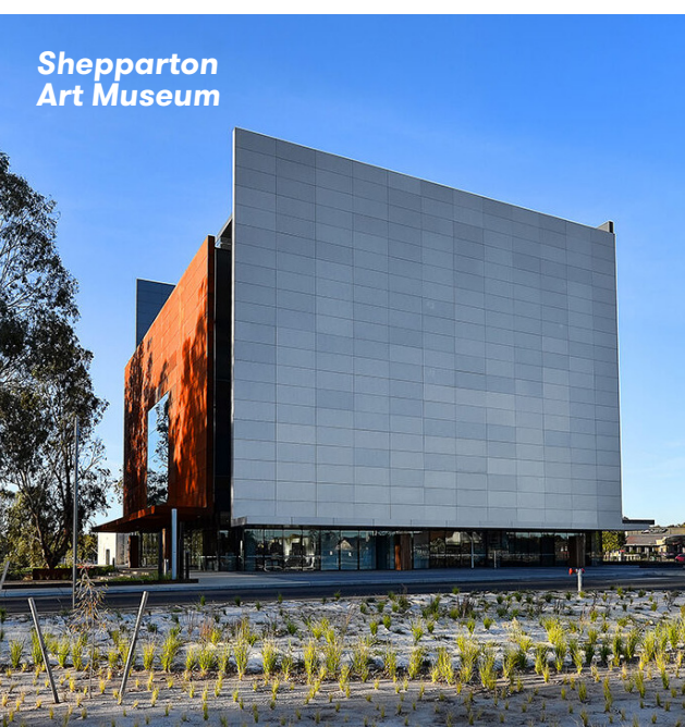
Shepparton Art Museum