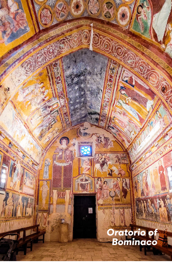
Oratorio of Bominaco