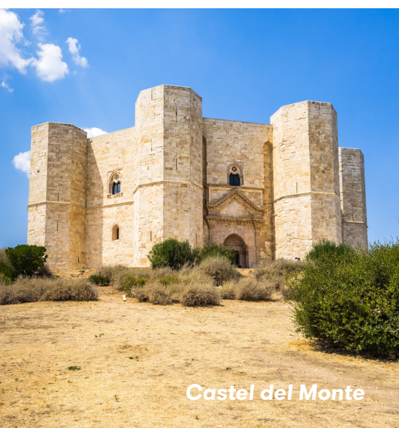
Castel del Monte