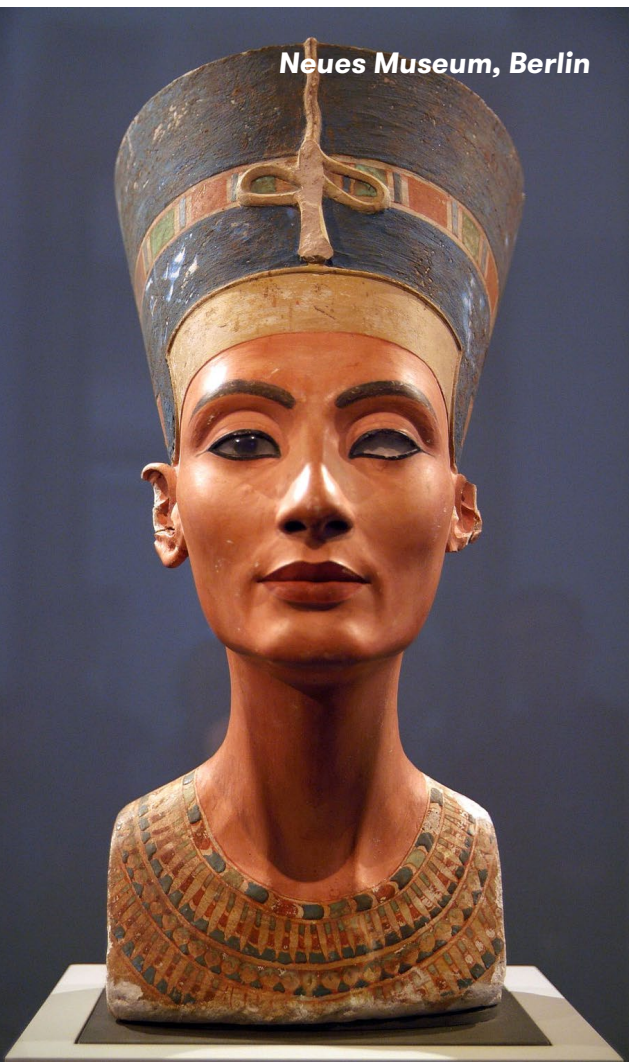
Neues Museum, Berlin

gardens, many of them with UNESCO World Heritage status. An undoubted highlight of the day is the visit to Frederick the Great's rococo summer palace, aptly called Sanssouci ('without worries' in French). We also visit Cecilienhof Palace, set in the beautiful park of Neuer Garten. The last palace built by the Hohenzoller family, Cecilienhof's rustic English Tudor design offers a contrast to Sanssouci. After an early dinner in Potsdam we return to Berlin. Overnight Berlin (B, D)