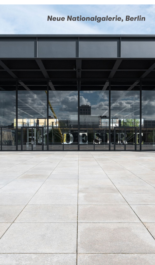
Neue Nationalgalerie, Berlin

a coalition of German forces. Then it's on to Meissen, on the banks of the Elbe not far from Dresden, to stroll the town and have lunch. We arrive in Dresden in the late afternoon and take an orientation walk through the old town. We view the Frauenkirche, an impressive Baroque church that was destroyed in World War II and beautifully restored and reopened in 2005. Overnight Dresden (B, L)