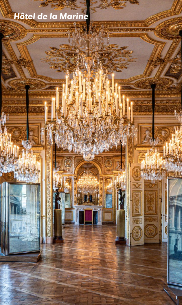
Hôtel de la Marine