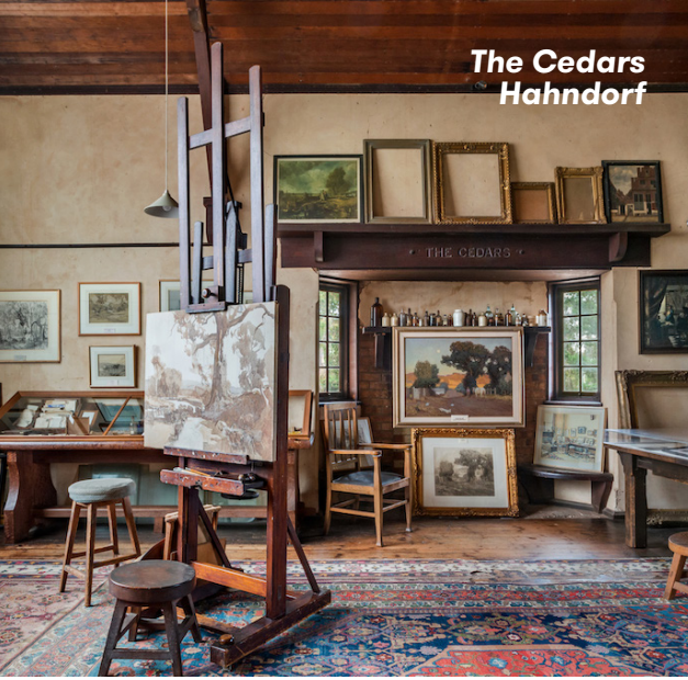
The Cedars Hahndorf