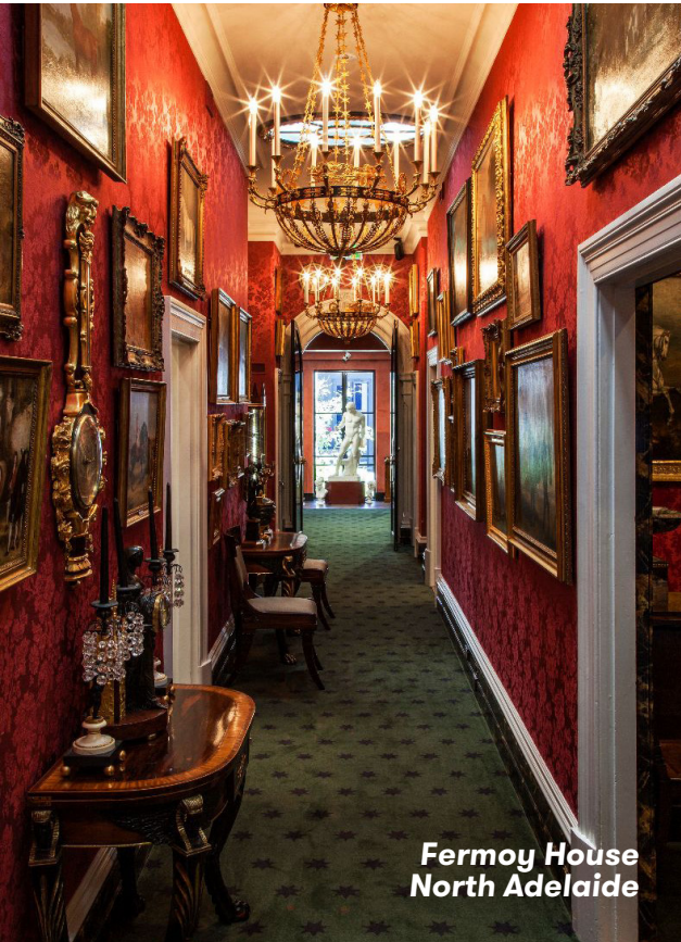
Fermoy House North Adelaide

Our day begins with a visit to the Botanic Gardens, before we make our way to North Adelaide for a guided tour of Fermoy House. This extraordinary museum houses one of Australia's finest collections of 18th- and 19th-century European fine and decorative art, assembled over 60 years by late the David Roche. There will be some time this afternoon to attend a Writers' Week session. Overnight Adelaide (B)