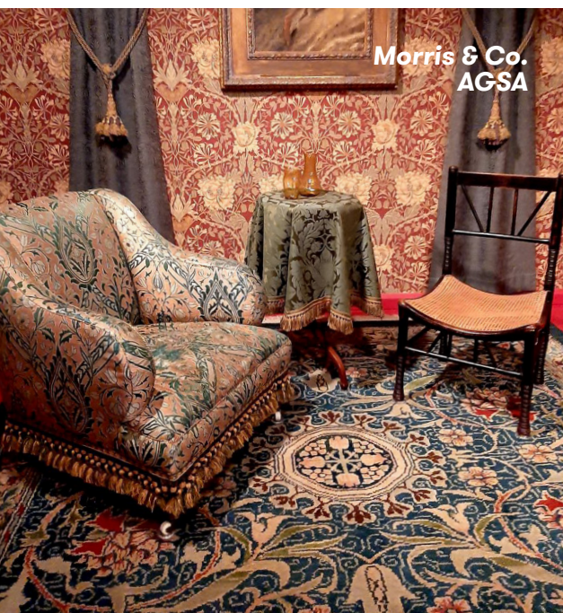
Morris & Co. AGSA

Director: Robert Lepage Adelaide Symphony Orchestra with Adelaide Festival Chorus