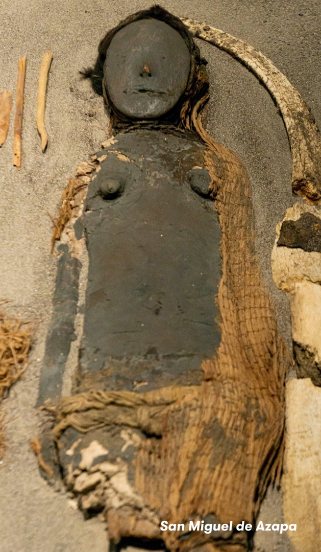
San Miguel de Azapa