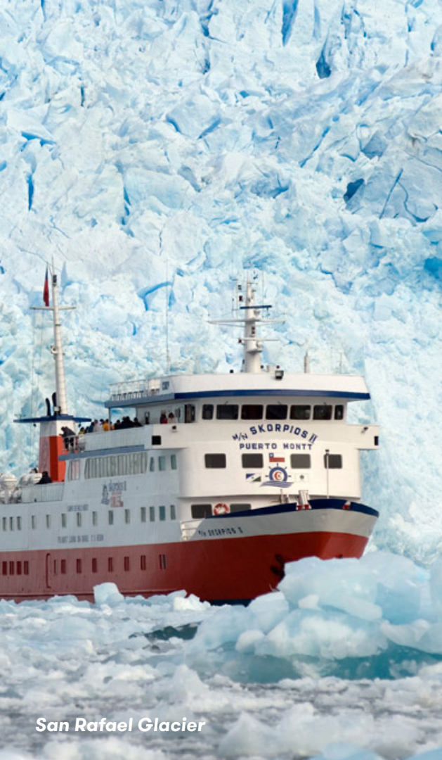
San Rafael Glacier