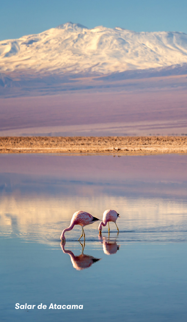
Salar de Atacama