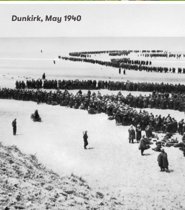
Dunkirk, May 1940