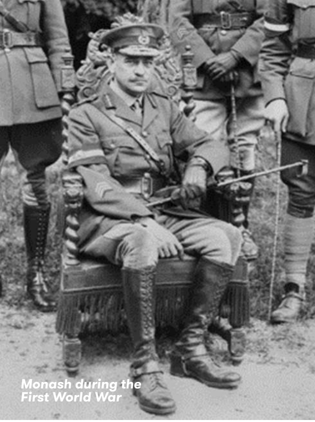
Monash during the First World War