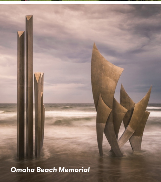
Omaha Beach Memorial