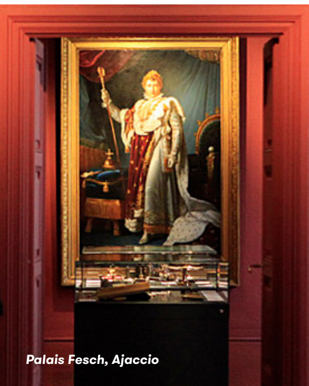
Palais Fesch, Ajaccio