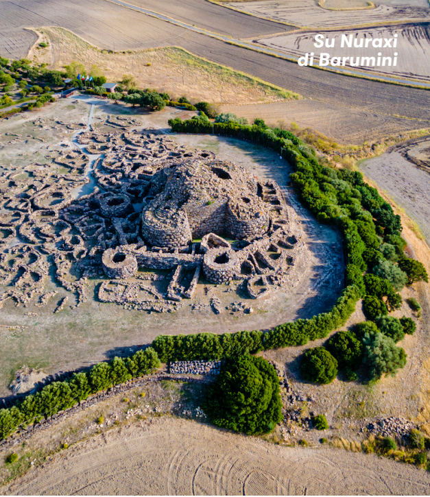
Su Nuraxi di Barumini