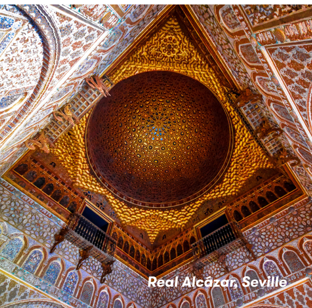
Real Alcázar, Seville