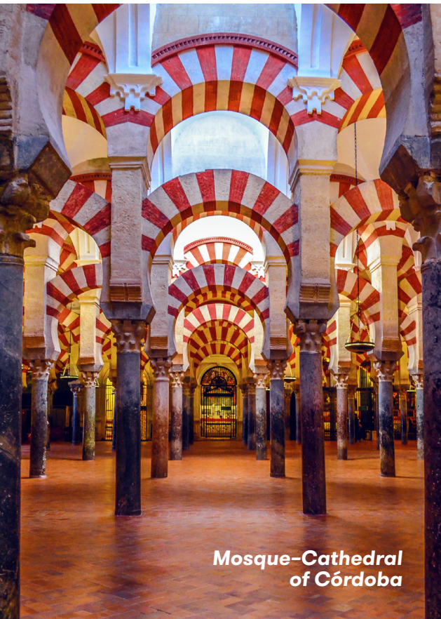
Mosque-Cathedral of Córdoba