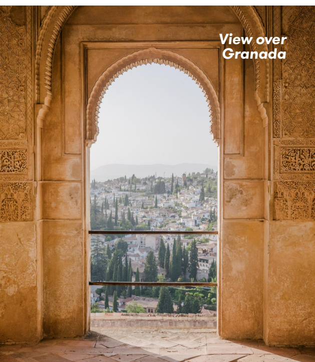
View over Granada

the palace buildings included a zoo, an aviary, numerous baths, and a weapons factory. Sacked by Berber invaders in 1010 and then abandoned, excavations only began on the site in 1910. Today we can see parts of the palace and mosque and a section of reconstructed gardens, and visit the world-class and award-winning museum. Returning to Córdoba the afternoon is at leisure and you may like to visit the plant-filled patios of the Palacio Viana, or simply explore the city. We meet back at the hotel in the early evening for a talk and your tour leader and manager will have suggestions for activities this evening. Overnight Córdoba (B)