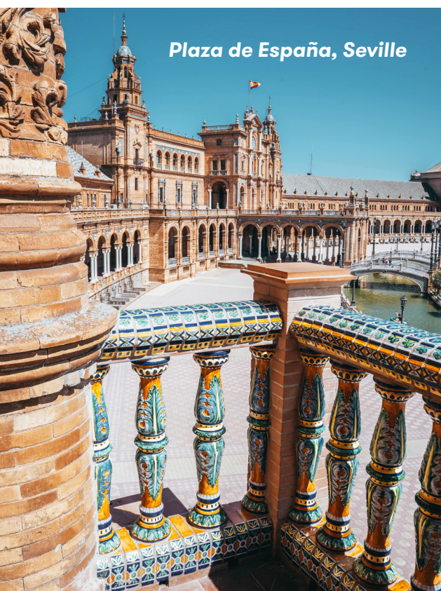
Plaza de España, Seville