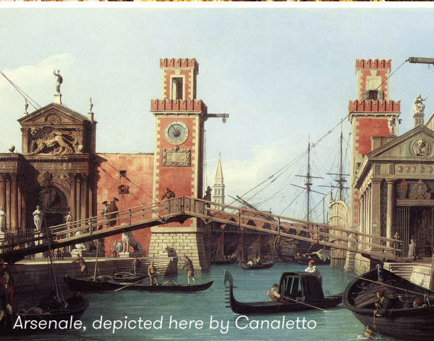
Arsenale, depicted here by Canaletto

This morning we take a guided tour of the Doge's Palace, whose layout reflects the complex structure of the Venetian government itself. The palace is decorated with large canvases by Tintoretto, Veronese and others. We then continue to visit the tombs of Venice's doges at Santi Giovanni e Paolo and Verrocchio's magnificent equestrian statue of Bartolomeo Colleoni. In the afternoon, there is the option of visiting the Museo Correr, with its collection of artefacts relating to the history of Venice and a number of significant works by Bellini, Antonello da Messina and Canova. This evening we hope to attend a performance at the historic Fenice theatre (subject to the season's program). (B)