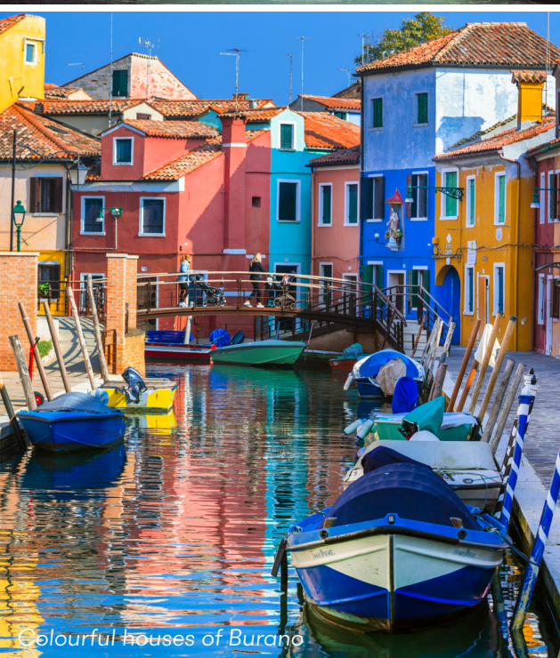
Colourful houses of Burano

This morning we visit the Rialto Markets, once Europe's premier trade and finance hub, and take a private tour of Venice's ghetto district and its synagogues. The Jews of Venice played an important role in the city and the ghetto has a fascinating history. After enjoying lunch together at Osteria da Rioba, a typical Venetian trattoria, we visit the Ca' d'Oro, a 15th-century merchant's palace on the Grand Canal, which is now a museum. The later afternoon is at leisure, with an early evening talk in our hotel. (B, L)