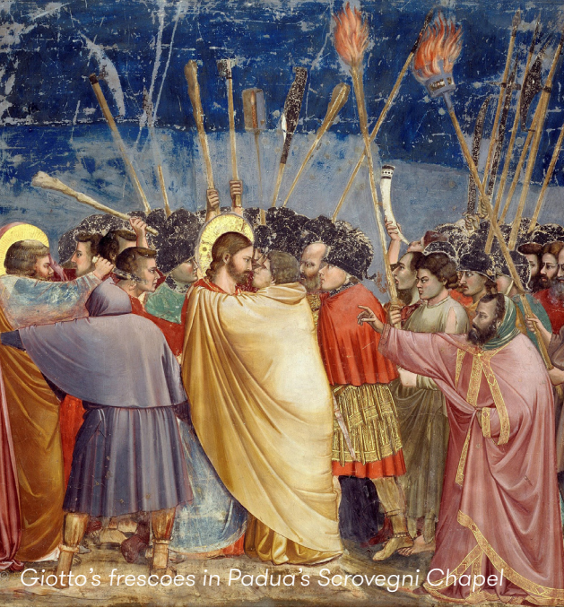
Giotto's frescoes in Padua's Scrovegni Chapel