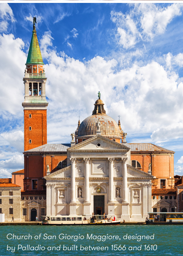
Church of San Giorgio Maggiore, designed by Palladio and built between 1566 and 1610

Venice in the 20th century became an international centre of modern art. Today we visit Ca' Pesaro, containing the city's collection of modern art, much of it collected at biennales from 1896 onwards. The collection includes works by Klimt, Chagall, Modigliani, the Italian Futurists and many others. After lunch, we continue on to the extraordinary Peggy Guggenheim Collection, located in one of the heiress's residences, the 18th-century Palazzo Venier. The collection includes outstanding works by Dalí, Kandinsky, Pollock, Magritte, Mondrian and Picasso. There is a talk in our hotel this evening. (B)