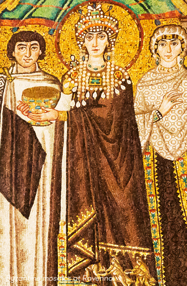
Byzantine mosaics at Ravenna