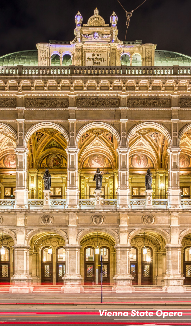
Vienna State Opera