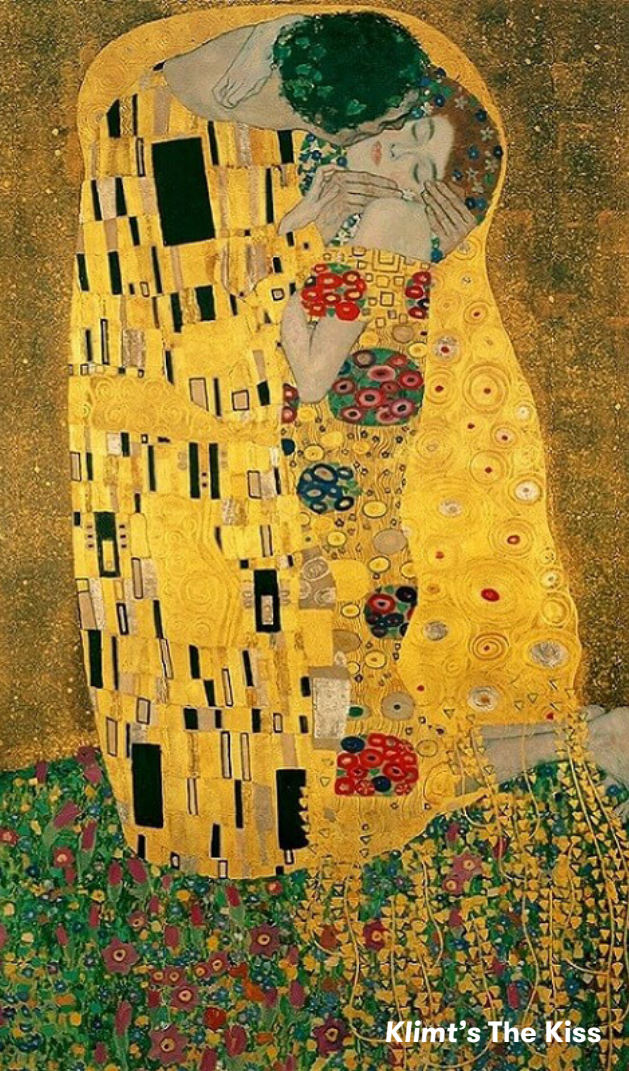
Klimt's The Kiss