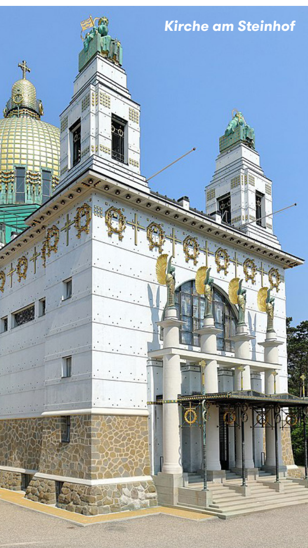
Kirche am Steinhof

sung by the Vienna Boys' Choir with the Hofmusikkapelle, the chapel choir established by Emperor Maximilian I in 1498. Following Mass we take a short walk to Demel, one of Vienna's most famous coffee houses, where we enjoy morning cake and coffee. The afternoon is free to explore Vienna at your leisure. Your tour leader can assist with suggestions for the city's fine museums and world-famous collections to suit your interests. We meet again this evening for a performance at the Konzerthaus – a quintessential experience in the capital of music. Overnight Vienna (B, MT)